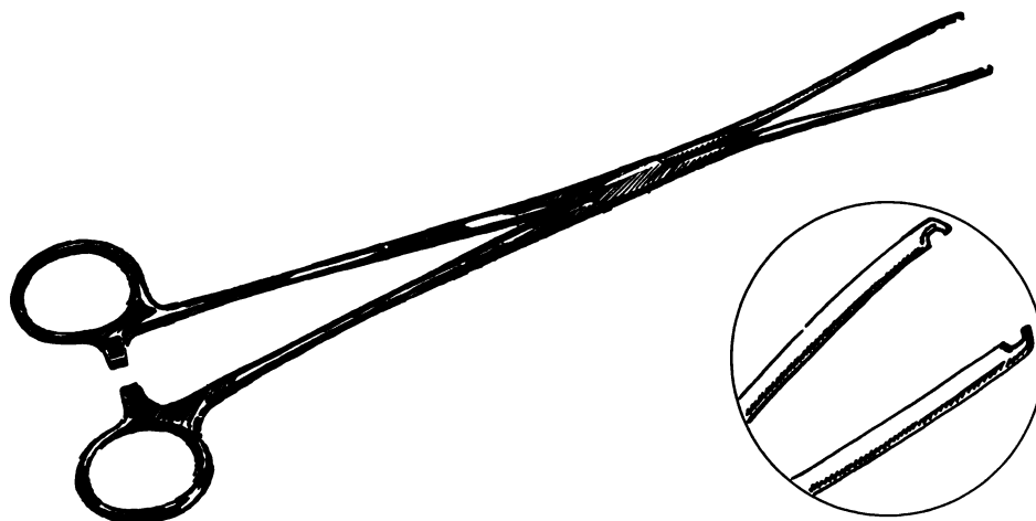
FIG. 1 Forceps, with detail of tip in circle.

The grasping and holding forceps presented here (Fig. 1) has proved helpful as a simple and secure method of handling a bone plate for fixation of a fracture. The forceps will facilitate the non-touch technique, and has many advantages for those who do not follow this technique. The operating field is unobstructed by hands holding the plate in